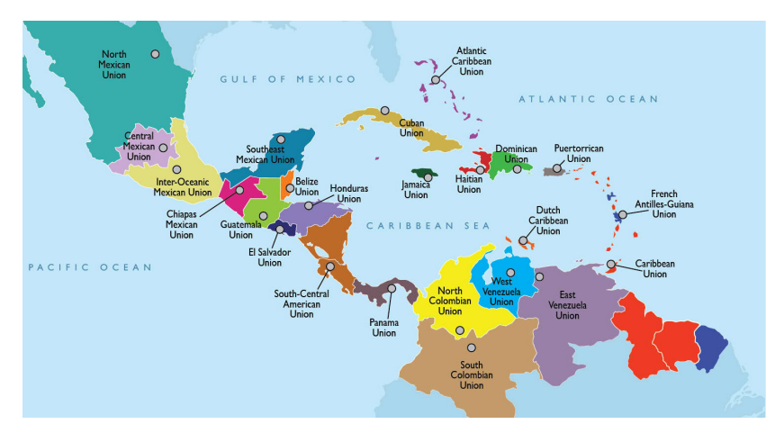
Locations of the Jamaica Union Conference and the Atlantic Caribbean Union Conference in the Inter-American Division of Seventh-day Adventists.

The university has four campuses in Jamaica, namely Mandeville Campus - its headquarters, East Jamaica Regional Campus - located in Kingston, West Jamaica Regional Campus - located in Montego Bay, and North Jamaica Regional Campus - located in St. Ann's Bay.